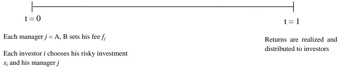
Figure 1: Timeline

At t = 0 , the two money managers compete in fees to attract clients. Each manager j = A, B optimally chooses what fee f_j to charge per unit of assets managed. Based on the fees simultaneously set by managers, each investor optimally decides how much to invest in the risky asset and under which manager. At t = 1 , returns are realized and distributed to investors.